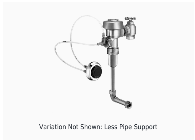
Variation Not Shown: Less Pipe Support